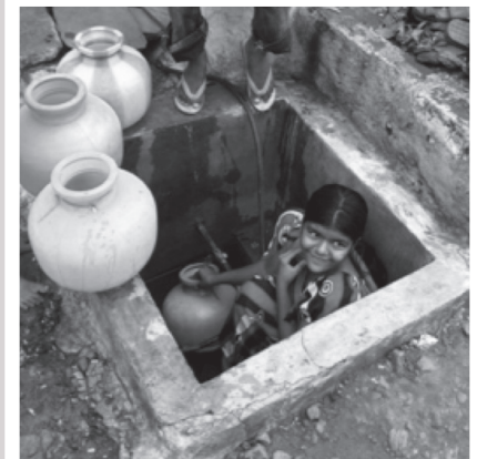
Collecting water, Hubli