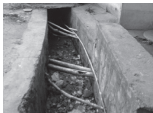
Part of the piped distribution system in Hubli